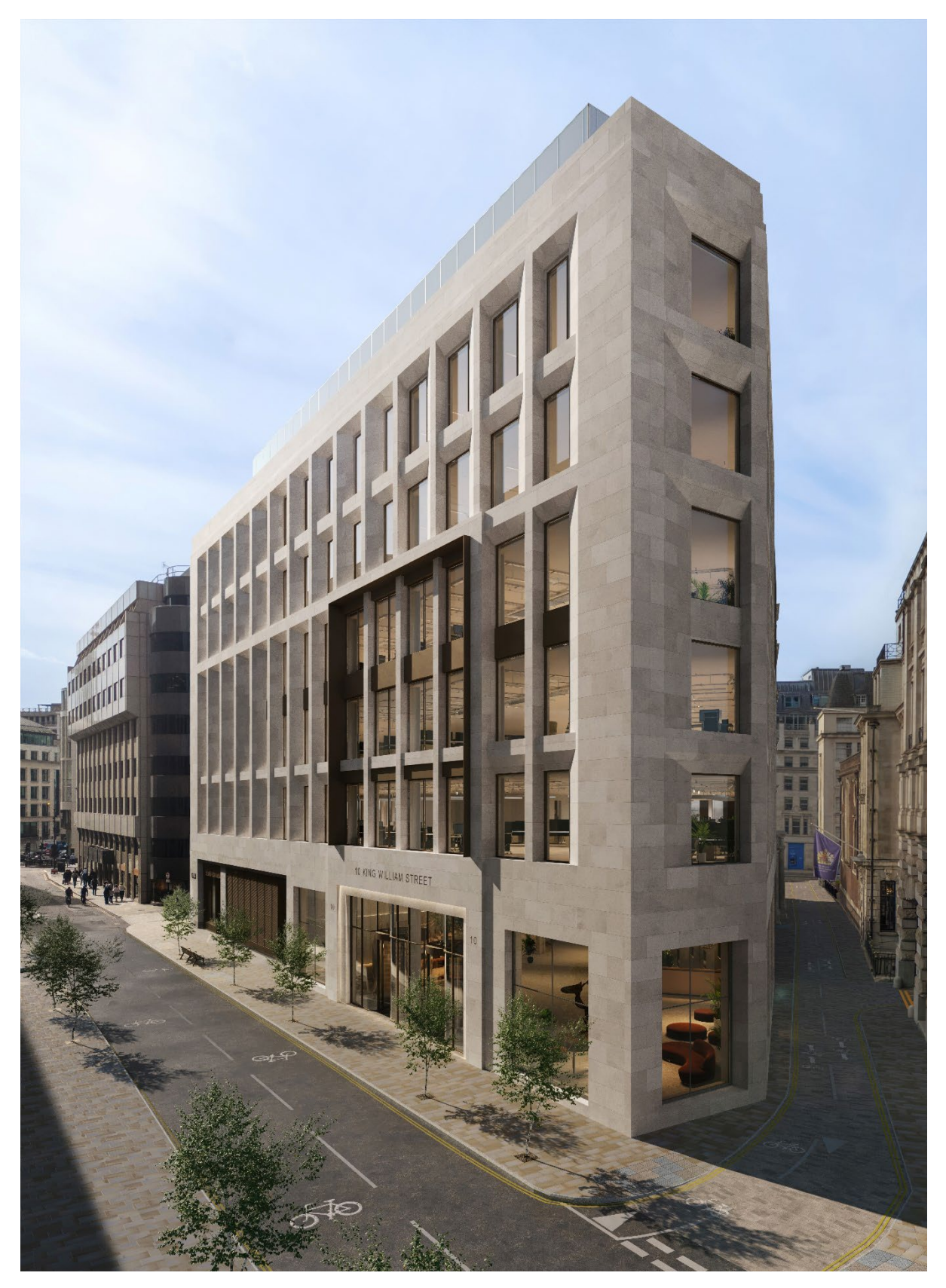
Fig 1. Office frontage on King William Street (including deferred KWS Improvement works) and view down Abchurch Lane