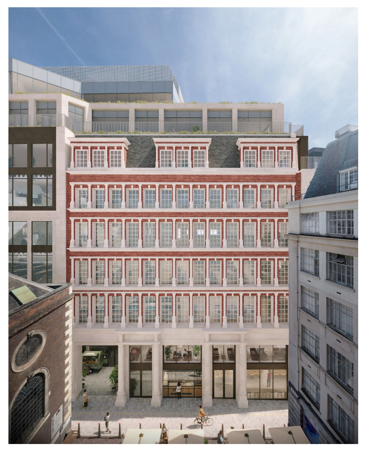
Fig 3. Abchurch Lane Heritage Façade repositioned to 'complete' Abchurch Yard and restored active frontages