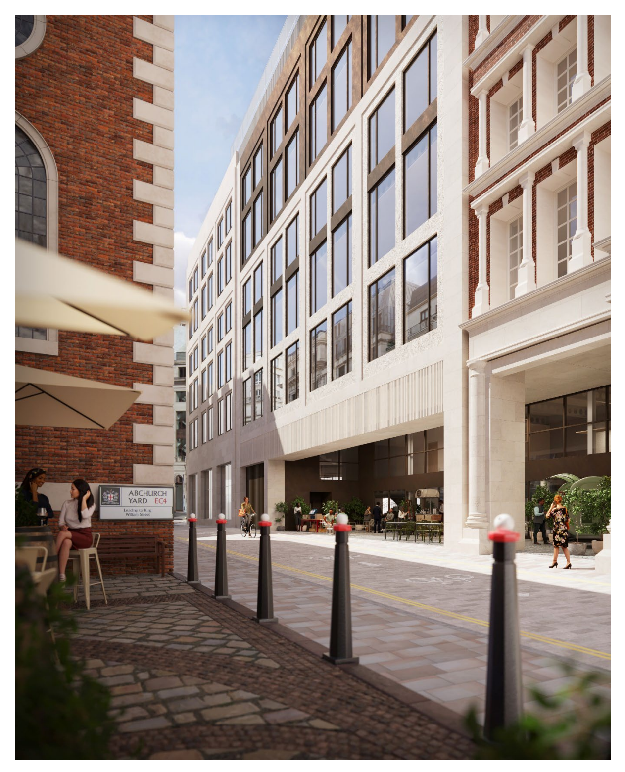
Fig 4. Abchurch Lane public realm enhancements and restored active frontages.